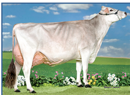
Pedrini Brookings Bookie Best Udder Italian National Show 2018 Owned by Pietro Pedrini, Italy