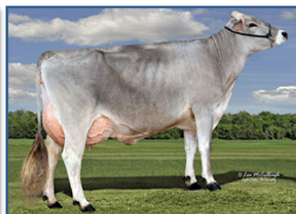
VB RIV Brookings Zaphina ET Owned by Voegeli Farms, Wisconsin