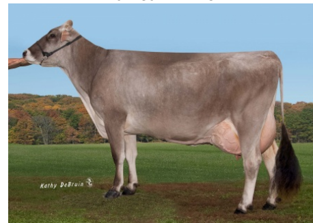
Dam: Switzer Tals Alibaba Davos 'VG 86 VG 86MS'