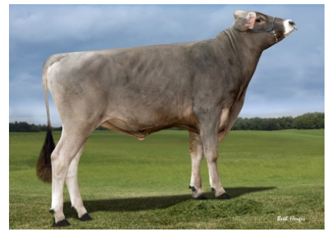
54BS557 GET LUCKY