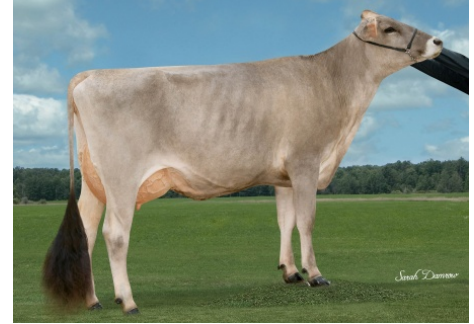
HF Lucky Darling 4629 Owned by Hendel Farms, MN