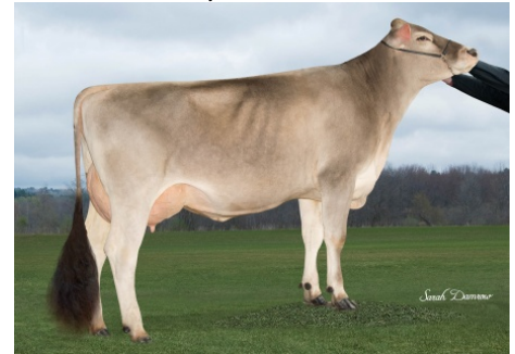
Hilltop Acres Lucky Dollar ET Owned by Hilltop Acres, IA