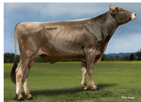
54BS573 LUCKY CARL