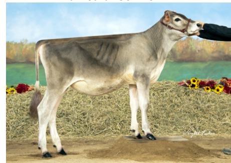
Fjel-Mar Lucky Carl Fallyn 1st Spring Calf MN State Show, 2019 Owned by Fjel-Mar Dairy, MN