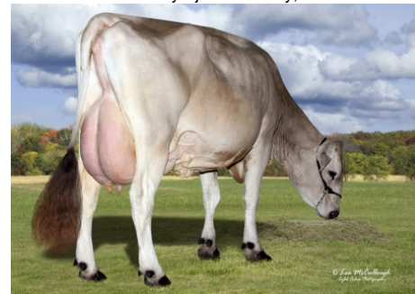
Dam: Kulp-Terra Cartel Cathy ET 'EX 90 EX 90MS' 2nd Lactation

NEW GENERATION GENETICS www.brownswiss.com (920) 568-0554 E-mail: info@brownswiss.com