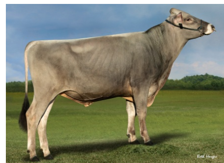
Hilltop Acres TK MERICA ET *TM

Sire: Cozy Nook Driver Tonka Dam: Hilltop Acres BK Maui ET '2E 91 E 91 MS' Lifetime: 1,785d 191,067m 7,686f 6,848p MGS: R N R Payoff Brookings ET MGD: Olson Music Dynasty Ming ET 'V 89' Lifetime: 1,685d 137,240m 7,418f 5,230p