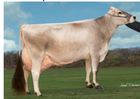
Dam: Hilltop Acres Bk Maui '2E 91 E 91 MS'