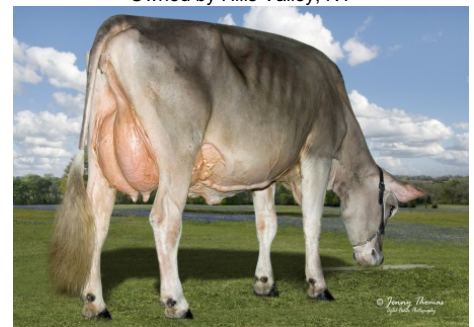
Dam: La Rainbow Sweet Silk ETV 'E90 E 91 MS' (2nd Lact)