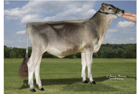
La Rainbow Silver Sweet Vibrant Owned by La Rainbow Farm, OH