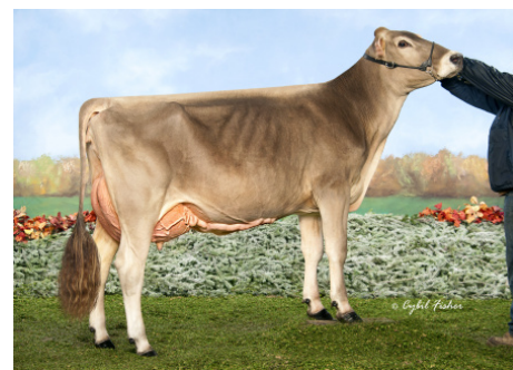
Twinkle-Hill Cadence Olivea 1233 Reserve All American Jr. 2 Year Old 2019 2nd Jr-2-Yr-Old World Dairy Expo 2019 Owned by Twinkle-Hill Farm, WI