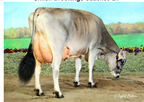
HF Cadence Aspen- 3rd Lactation 1st Sr-3-Year-Old Minnesota State Fair 2017 Owned by Hendel Farms, MN