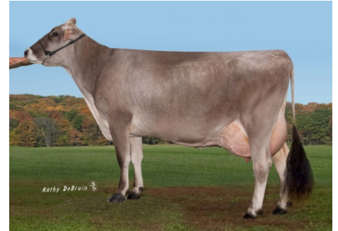
Dam: Switzer Tals Alibaba Davos 'VG 86 VG 86MS'