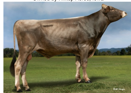
54BS573 LUCKY CARL ET*TM