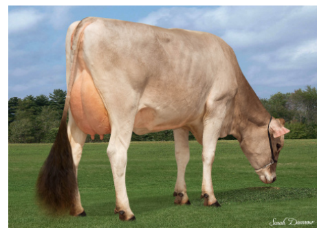
Hilltop Acres Carl Disney Owned by Hilltop Acres, Iowa