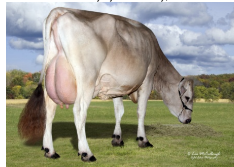
Dam: Kulp-Terra Cartel Cathy ET 'EX 91 EX 91 MS' 2nd Lactation 2-02 365d 2x 31,464 4.5 1,415 3.7 1,152 3-10 365d 2x 34,080 4.2 1,427 3.5 1,207